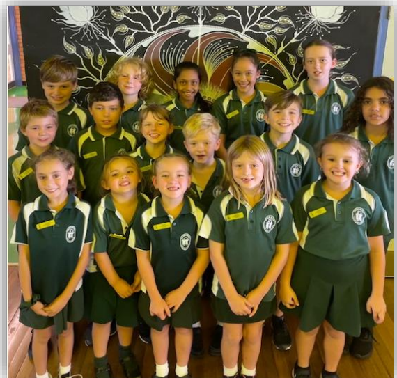
2021 SRC Representatives

Can you please save your bread tags and send them in with your child, where they will be collected in the classroom.